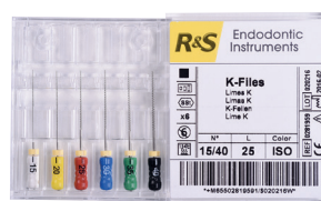
K-files, K-reamers and H-files