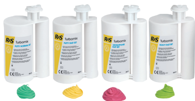
Turbomix putty (normal/fast) Turbomix monophase fast Turbomix heavy fast