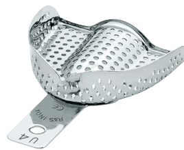
Perforated impression trays